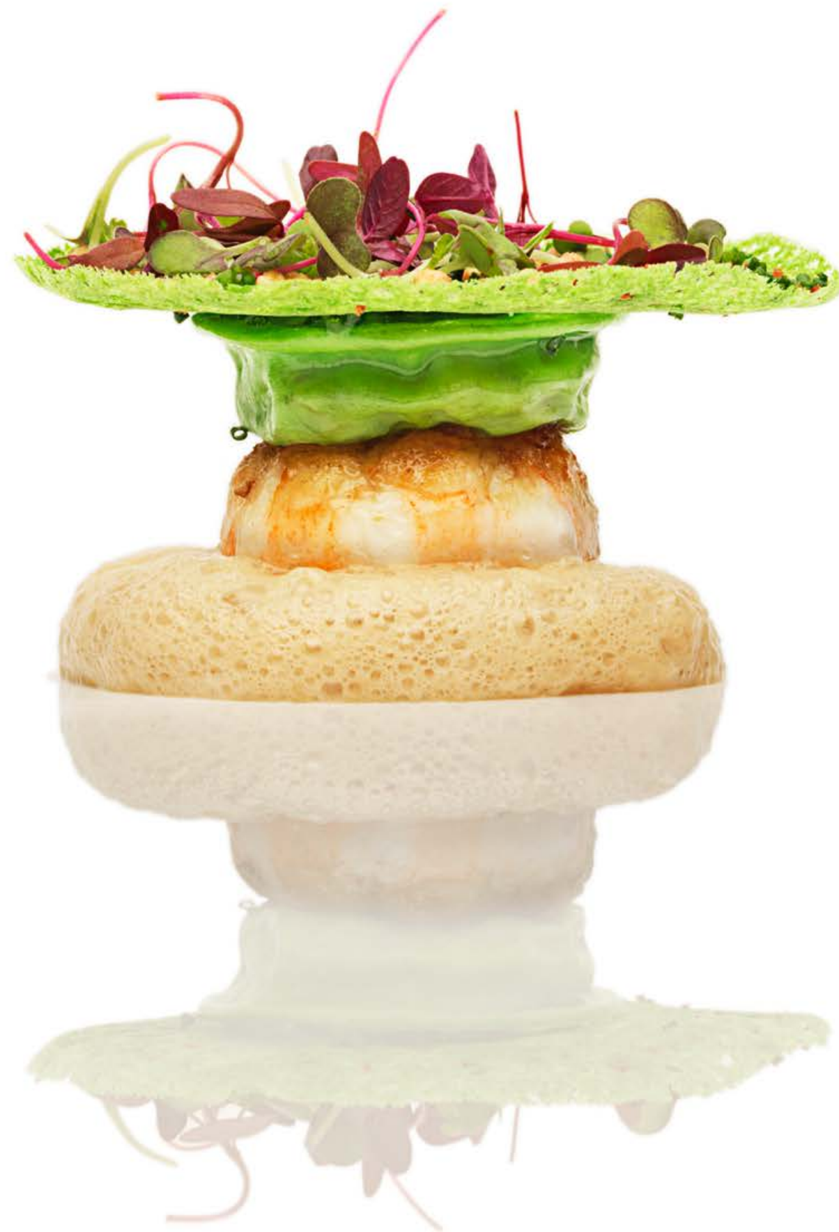
North Sea Langoustine with smoked leek and goose Ossiano